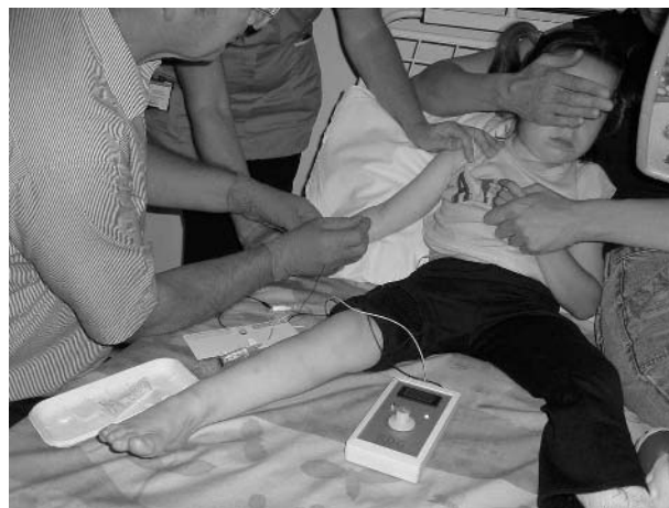
Figure 2 Injection of BT-A in the upper limbs using nerve stimulator.

Careful assessment is needed to determine those leg muscles responsible for gait deviations in mobile children with bilateral CP, and which may be suitable for injection. Crouch gait is common, often due to hip flexion from overactive psoas muscles. Either a posterior or anterior approach is used to this muscle, but both are difficult. The posterior approach from the back must be done under general anaesthesia with x ray screening to ensure the peritoneum is