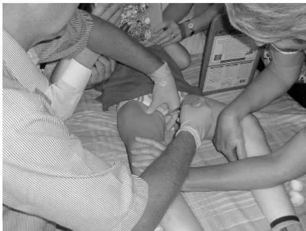
Figure 1 BT-A injection to the lower limbs.

Young children respond best to treatment, from as early as 2 years of age. 34 This is because they rarely have contractures and are more receptive to changes in motor patterning. BT-A has more effect if followed by therapy to stretch the muscle and revise movements. Carers can be asked to do this, supervised by the therapist who may arrange a package of